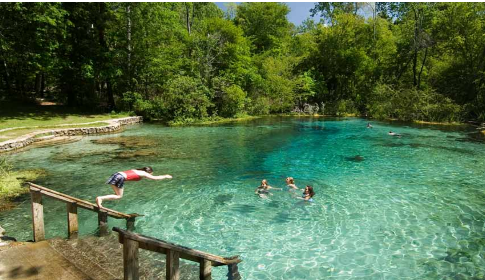
Taking the Plunge, Ichetucknee Springs State Park, Columbia County, photo by John Moran/JohnMoranPhoto.com

in that time in the spring-fed Ichetucknee River, a tributary of the Suwannee, which they link to pumping in south Georgia and northeast Florida, now the equivalent of pulling 80 million gallons of freshwater a day to the east. Even along the slower-growing coastal Panhandle, some water levels in the sand-and-gravel aquifer have plummeted more than 100 feet since 1950, causing utilities to punch their wells farther and farther inland.