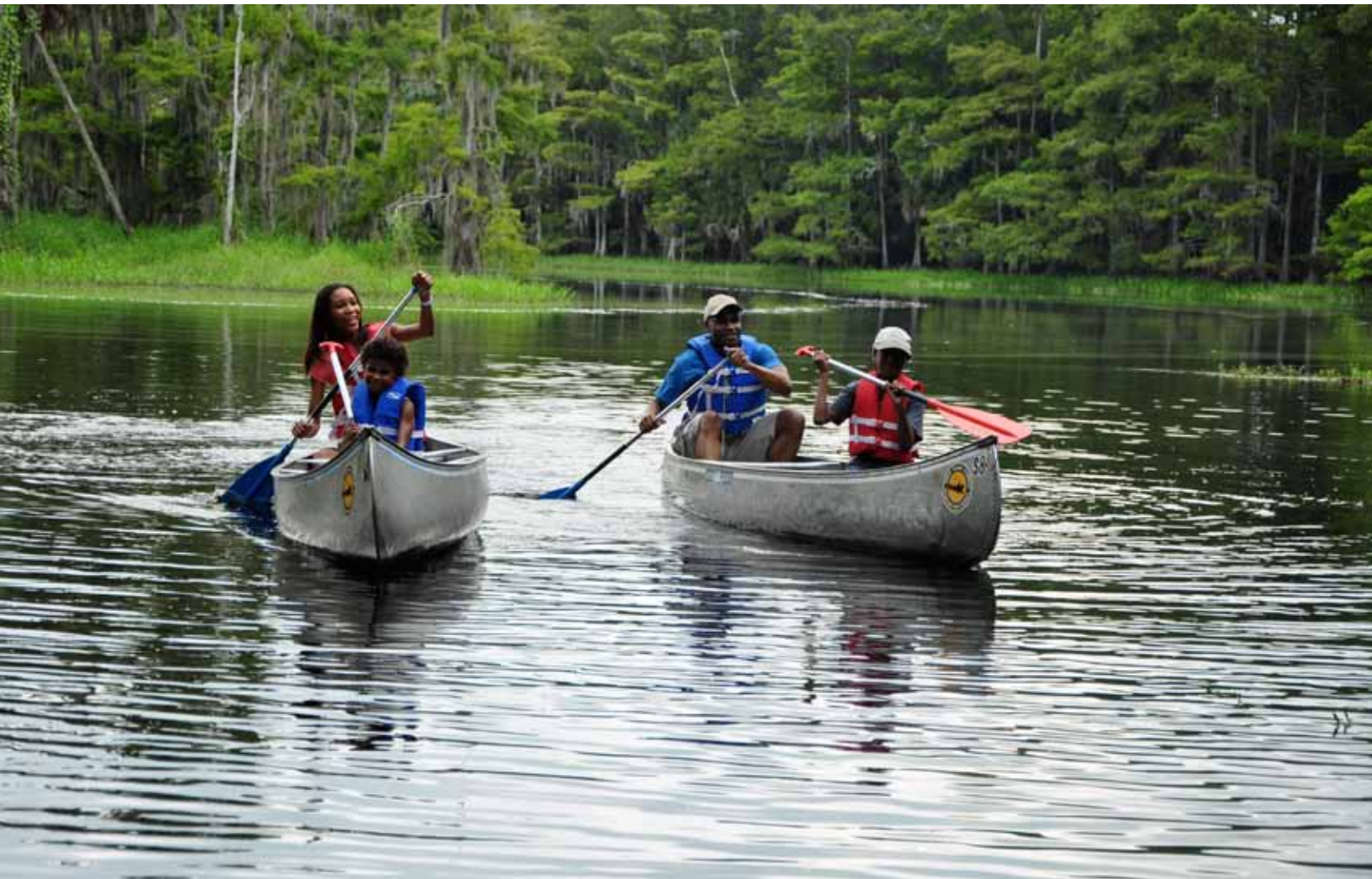
Canoeing on Fisheating Creek, Glades County, photo by Ilene Safron

means less running into sewers: conserving that much saved an additional $1.1 billion in wastewater treatment and storage costs.