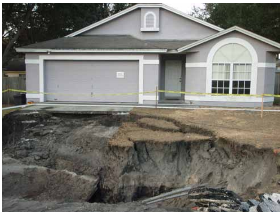
Plant City, Hillsborough County, Department of Environmental Protection

Businesses are beginning to put water conservation on par with greenhouse-gas reductions as integral to sustainability plans. Filtration advances make recycled water an option for even those industries that require the purest water. U.S. food giant Kraft — which has cut global water use